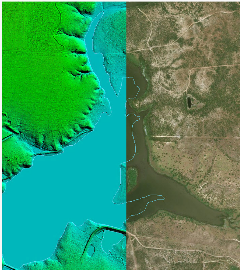
Hydrological feature from project lidar data (left) compared to non-drought imagery (right)

Additionally, several lakes/ponds would have been omitted for not meeting the minimum two-acre size criteria. These conflicts of elevation in the hydro-flattened Digital Elevation Models (DEMs) would have limited the utility of the data to all agencies. The selected process ensured hydrological events could be monitored with confidence and guaranteed proper map accuracy. This enhanced data can be used by many agencies such as the U.S. Army Corps of Engineers (USACE), TWDB and Natural Resources Conservation Service (NRCS) to verify information required for river level management.